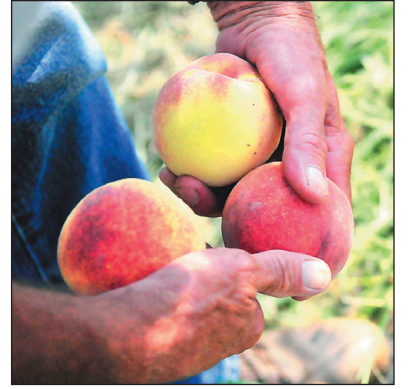
The end of peach picking is in sight.

Go to Business&Finance, page B5, for more about fruit crops.